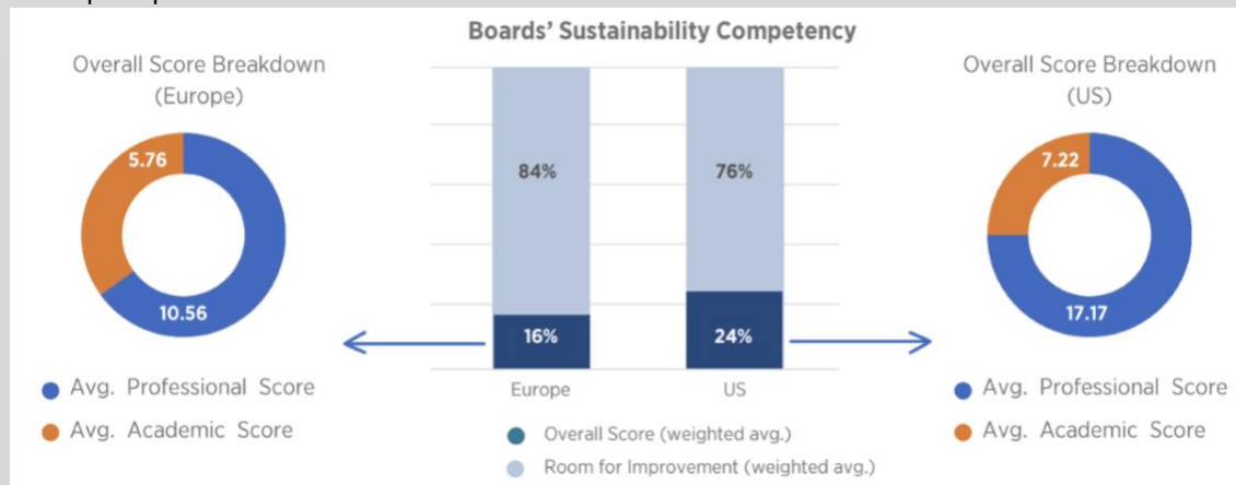
Figure 2: Key Findings from the Assessment

Concerningly few boards have been found to have sustainability-related experience, according to a review conducted by Competent Boards and the Copenhagen Business School of US and European Fortune 500 companies. Only 2% of these businesses were evaluated as "beacons of progress" due to their boards' outstanding sustainability competency. More than 4% of boards evaluated show no sign of proficiency or competence in this critical area. The study surprisingly shows that US boards are slightly better prepared to tackle sustainability challenges compared to their European peers.